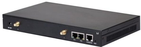
DWG2000E-8G/C-M (Built in 4-1 Antenna Power Divider )