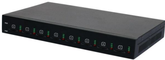
DWG2000E-8G/C (Standalone Antennas )